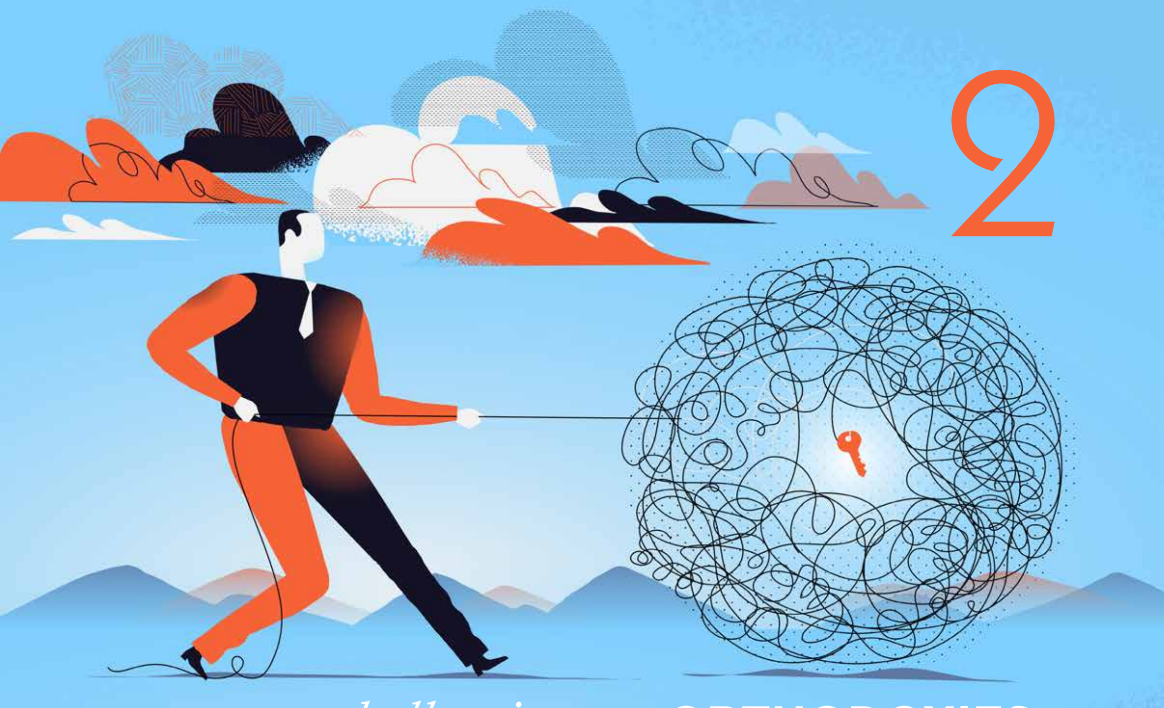
challenging our ORTHODOXIES