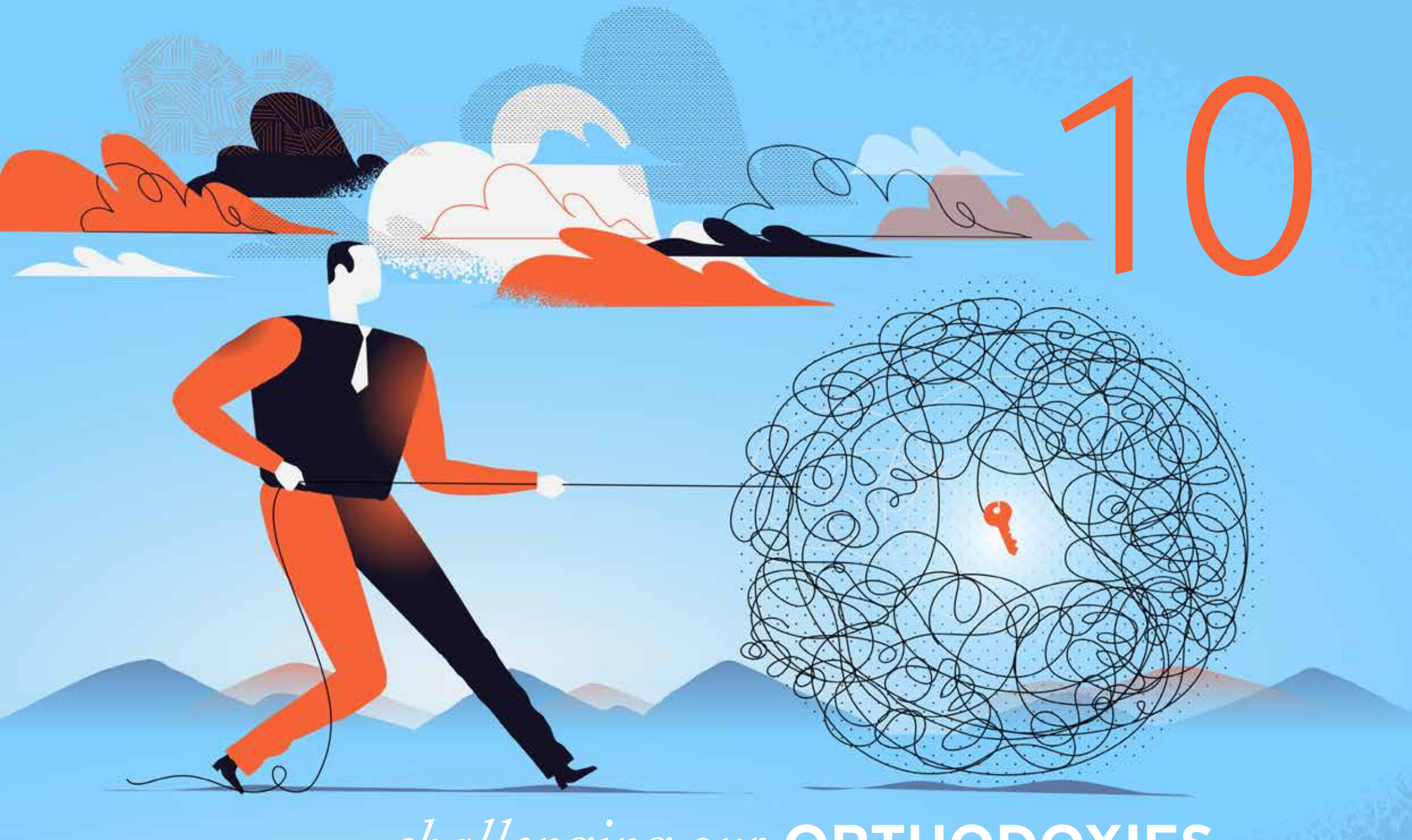
challenging our ORTHODOXIES