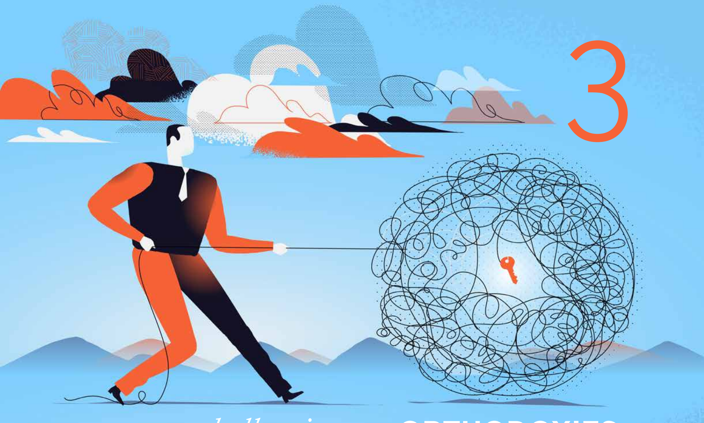
challenging our ORTHODOXIES