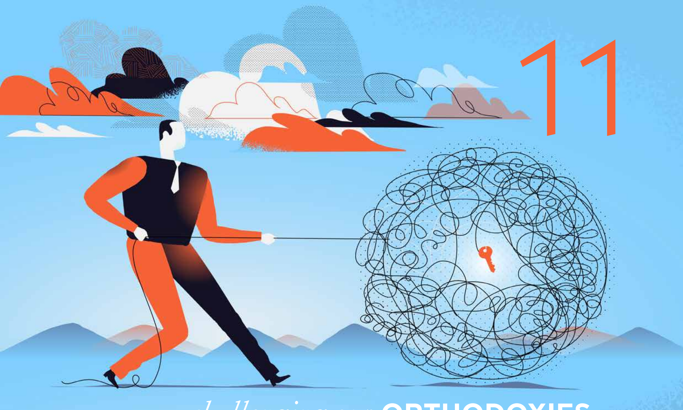
challenging our ORTHODOXIES