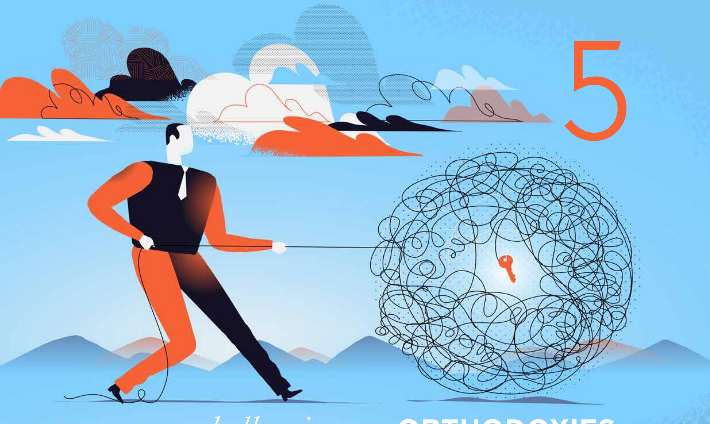
challenging our ORTHODOXIES